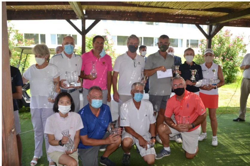
Cpto. Seniors de Andalucía