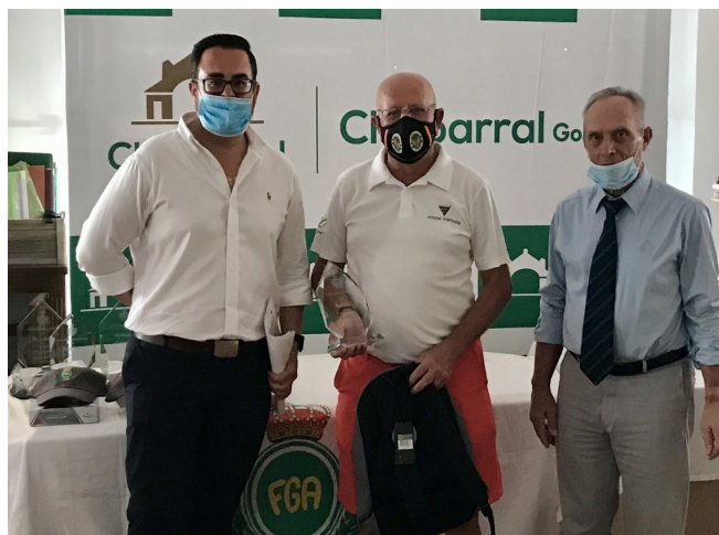
Circuito Senior-El Chaparral