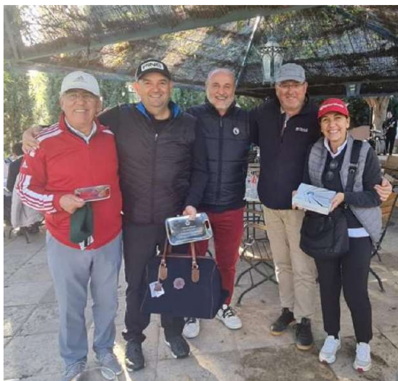
TORNEO SENIOR NAVIDAD VILLA PADIERNA GOLF