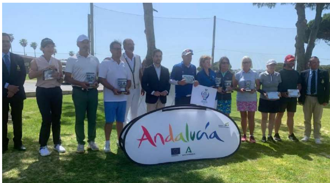
Cto. Seniors de Andalucía Golf Novo Sancti Petri Primeros Clasificados