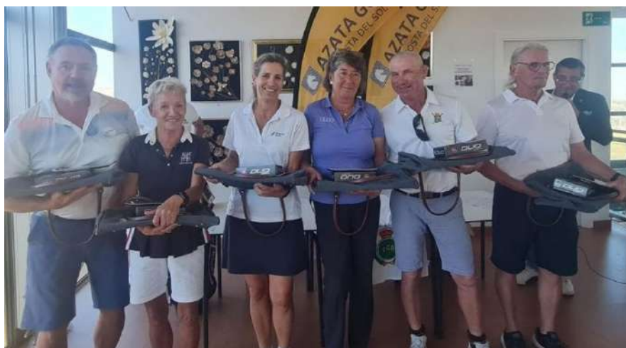
Circuito Seniors Azata Golf