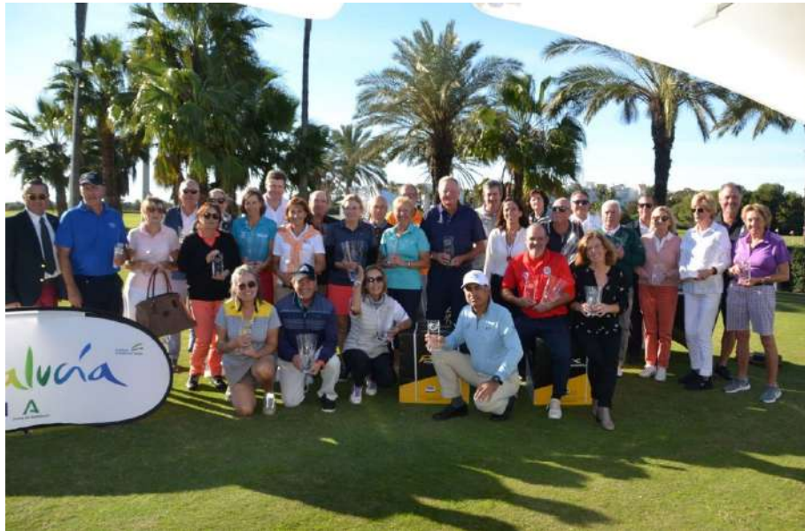
FINAL CIRCUITO SENIORS DE ANDALUCÍA COSTA BALLENA PRIMEROS CLASIFICADOS