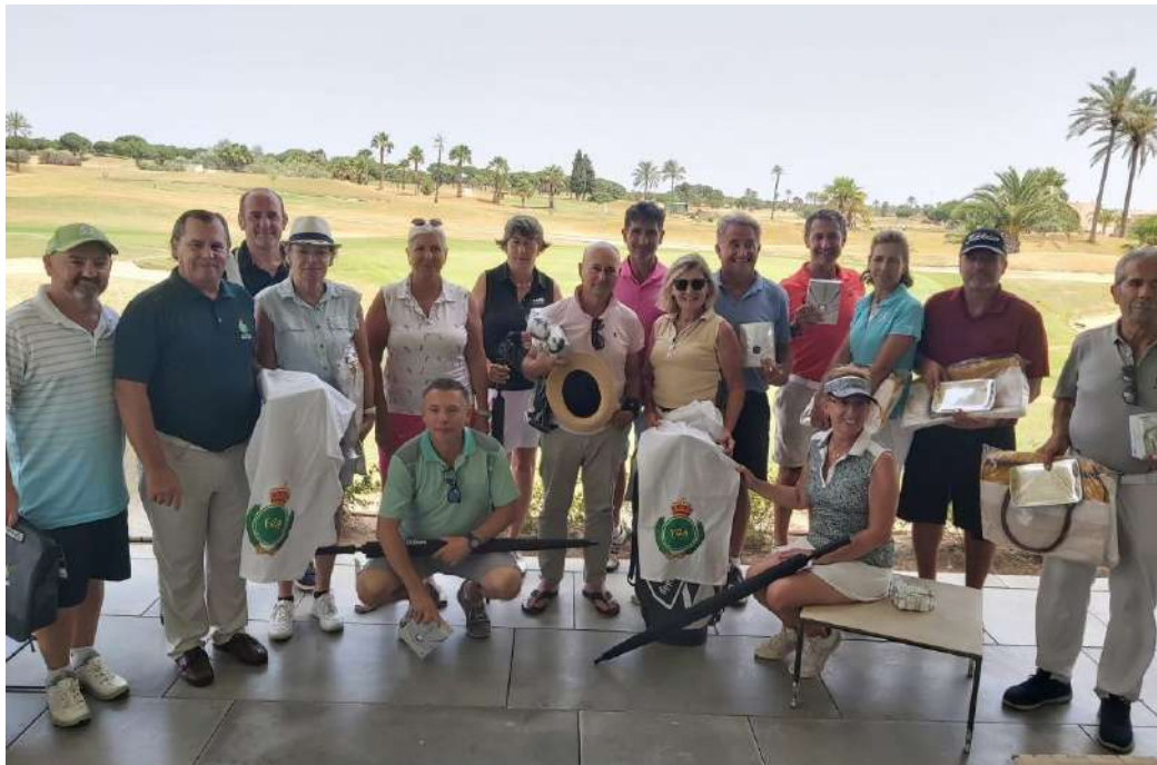
Circuito Seniors Villa Nueva Golf Primeros Clasificados