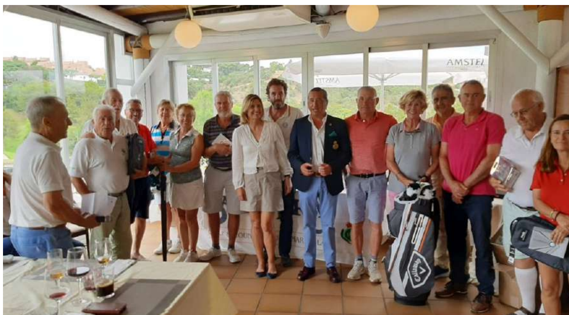
TORNEO SENIOR COSTA DEL SOL Santa María Golf