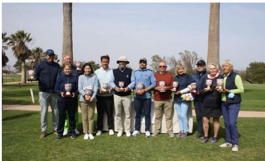
Cto. Internacional de Andalucía Dobles Seniors El Parador de Málaga de Golf